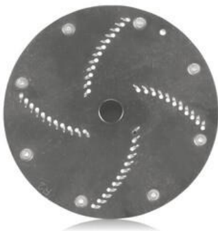
Shredding Disc – Coarse, 4mm For Old Cheese 80-10-15