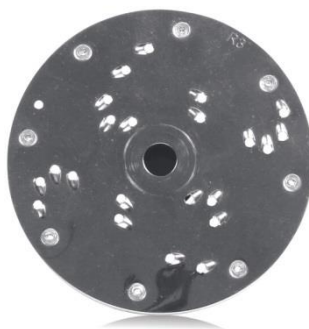
Shredding Disc – 3mm For Matured Cheese 80-10-14