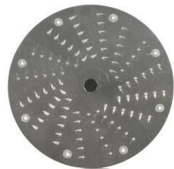
Shredding Disc -Powder For Parmesan Cheese 80-10-16